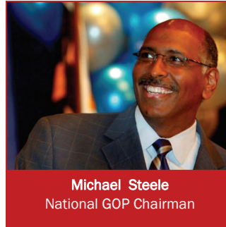
Michael Steele National GOP Chairman

In addition to endorsing judicial candidates and electing our leadership team, the State Committee also passed the 2009 budget with a projected income of $5,020,000 and projected expenses of $4,541,200.