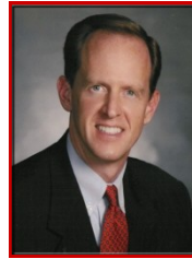
Pat Toomey – U.S. Senate