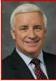
Tom Corbett – Governor Jim Cawley – Lt. Governor